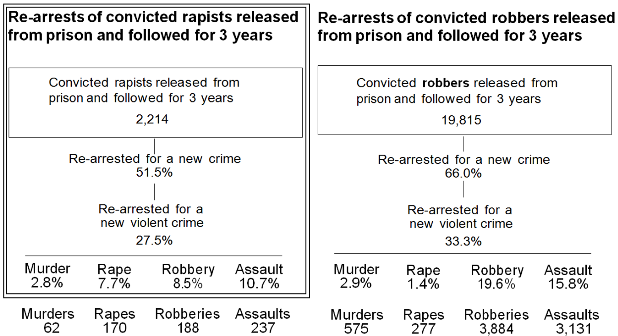
Figure 3. Relative dangerousness of rapists and robbers. The figure in the double box on the left is reproduced from a major US federal report on sex-crime statistics (Greenfeld, 1997), Fig. 27 (page 26). On the right, we provide the corresponding data for robbers from the same data source. Released robbers have higher recidivism and are responsible for a far greater number of violent crimes, including rapes. No government has ever published a report on recidivism of robbers.

On all measures except rape, the robbers had a higher recidivism rate than the rapists. We learn about the relative dangerousness of the two groups by looking at the numbers of crimes committed by each in the bottom row of the chart. Although the percentage who were arrested for rape after release was lower for robbers than rapists (1.4% vs. 7.7%), the much larger number of robbers (19,815 vs. 2,214) means that the robbers were arrested for far more rapes than the rapists were (277 vs. 170). The difference for other violent crimes is far more stark. The released robbers were arrested for almost ten times as many murders (575 vs. 62) and 13 times as many assaults (3,131 vs. 237).